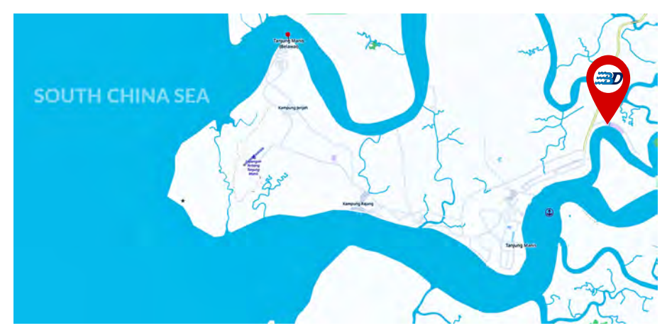
02° 11. 5563' N 111° 22.7232' E

Berjaya Dockyard (Sibu) specializes in the construction of high-performance utility vessels such as Landing Craft, Workboats and Multi-Purpose Tugs for the local and international shipping, offhore oil and gas industries.